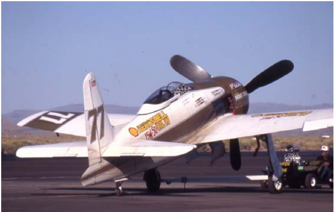
Rare Bear #77 at 1996 Reno Air Races