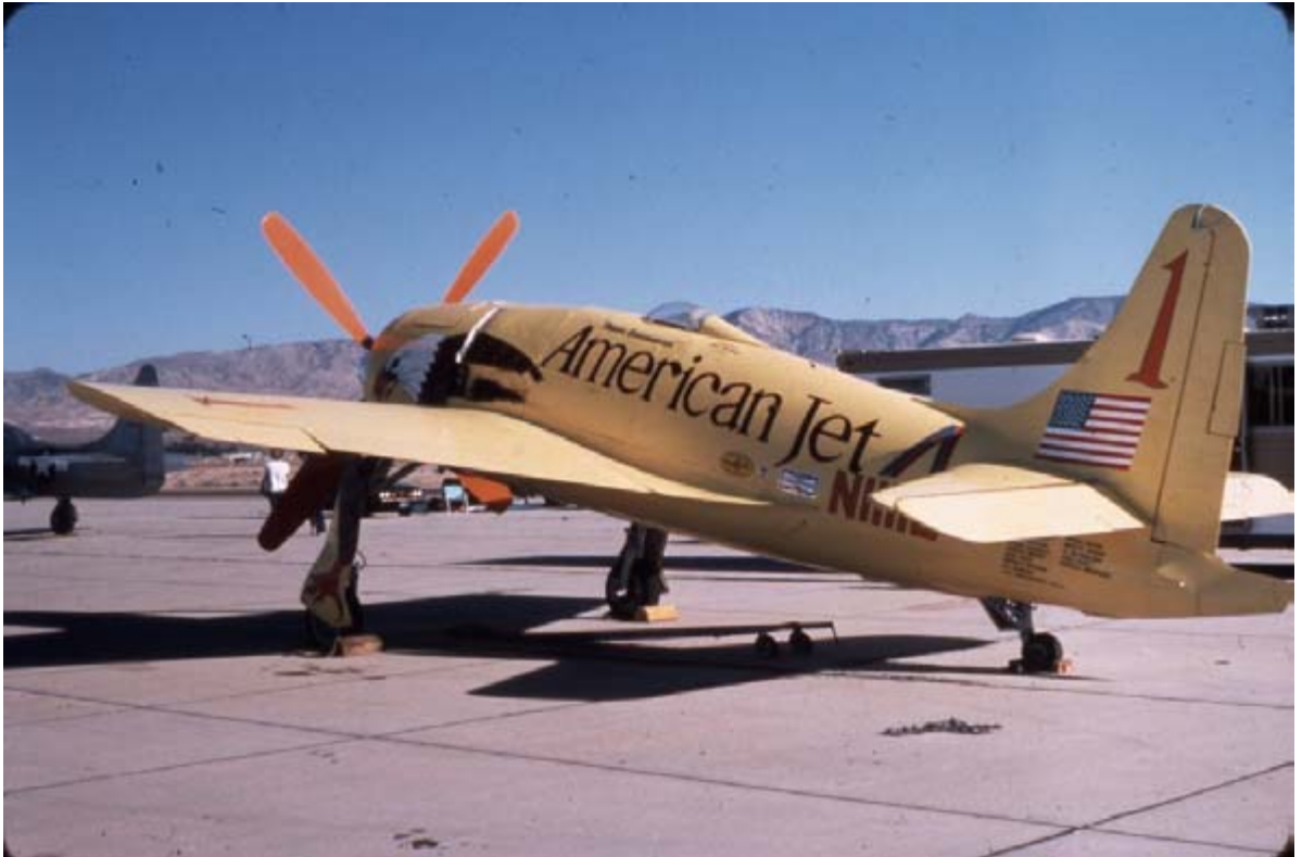
Conquest I as American Jet #1, F8F Bearcat