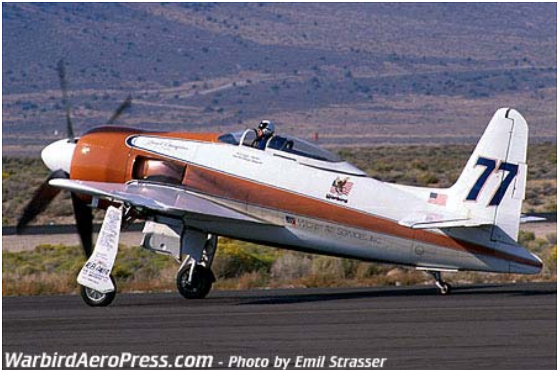
Rare Bear #77