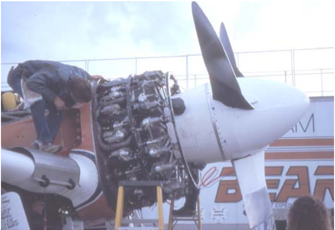
Rare Bear #77, Cowling Removed from R-3350