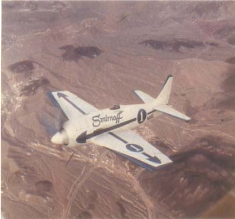
Smirnoff #1 Bearcat