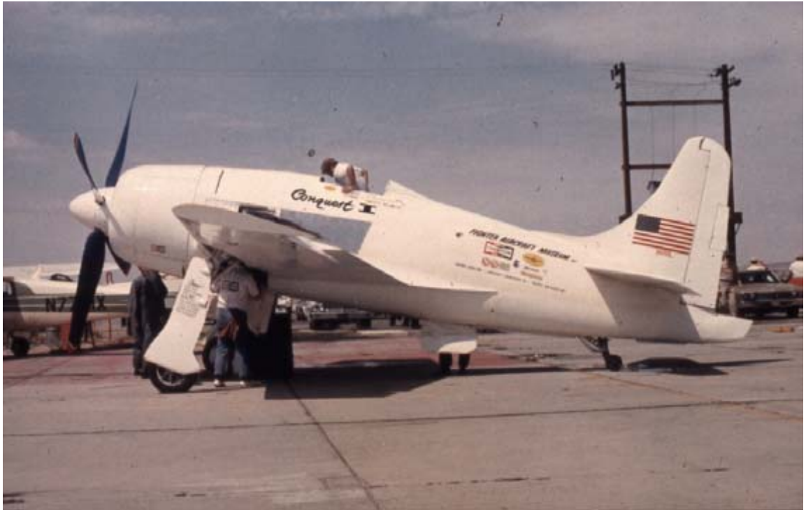
Conquest I , 1969 World Speed Record