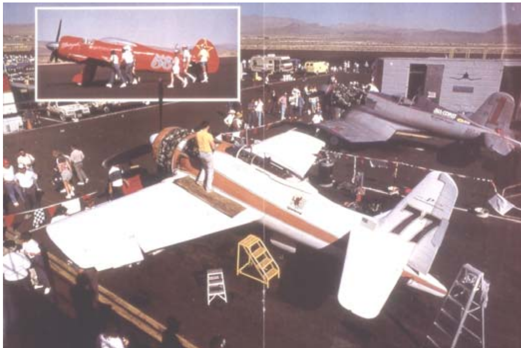
R-3350 Powered F8F Bearcat Rare Bear #77